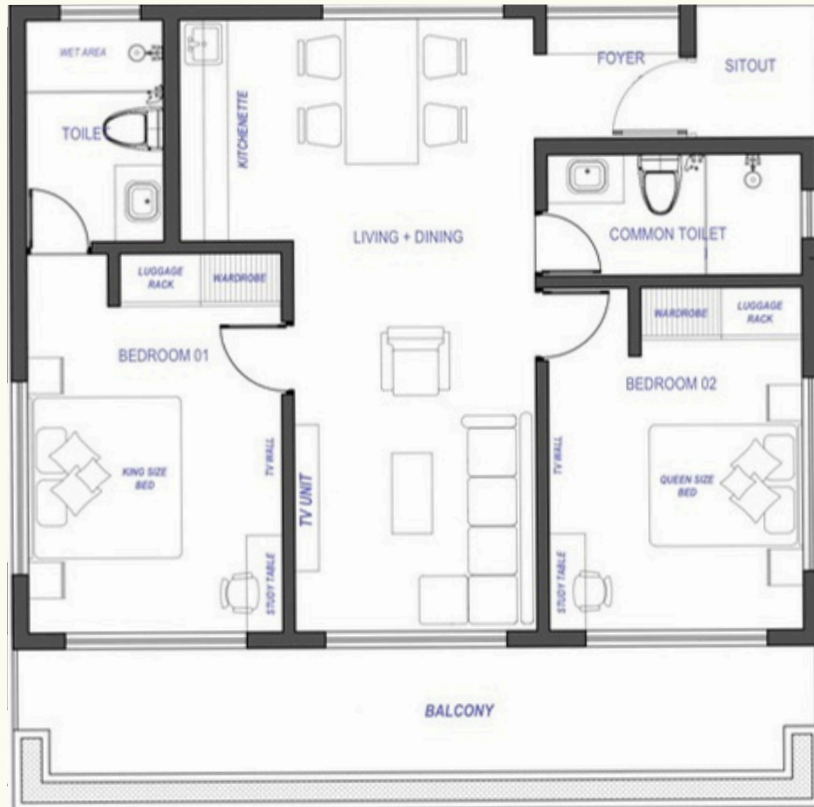
TWO BEDROOM LAYOUT 3 UNITS